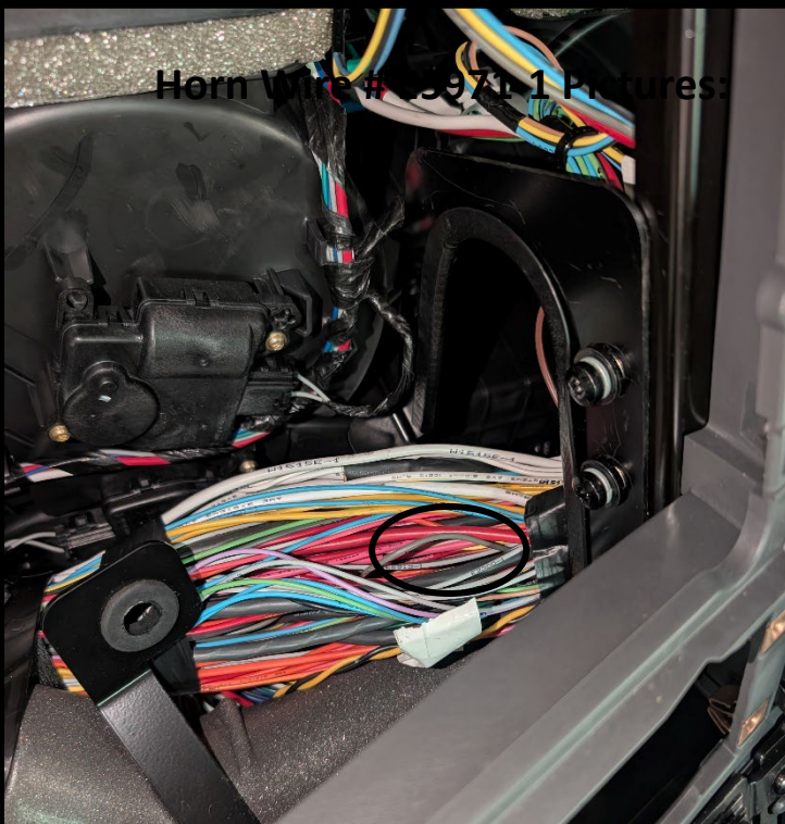
Horn Wire # E5971-1 Pictures:

Safety note: isolate the vehicle battery before beginning work to avoid short circuits or accidental airbag/horn deployment. If unsure, consult a professional.